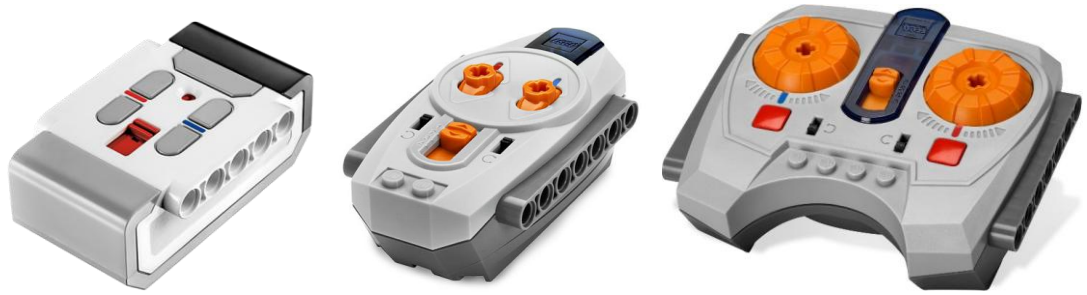
Figure 2 «Examples of IR-remote control devices»

Therefore, robots controlled from IR-remote control devices are not allowed for using during the competition.